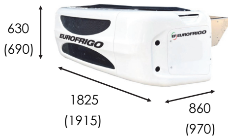
Units in mm, Data between ( ) relates to model D12